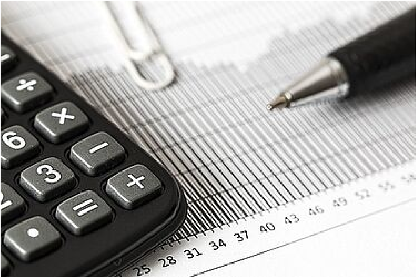
Demande de subvention